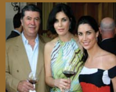
The Padilla family