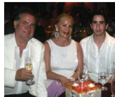
The Bitterlin family